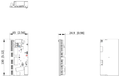
Unit:mm [inch] SCALE 1:1